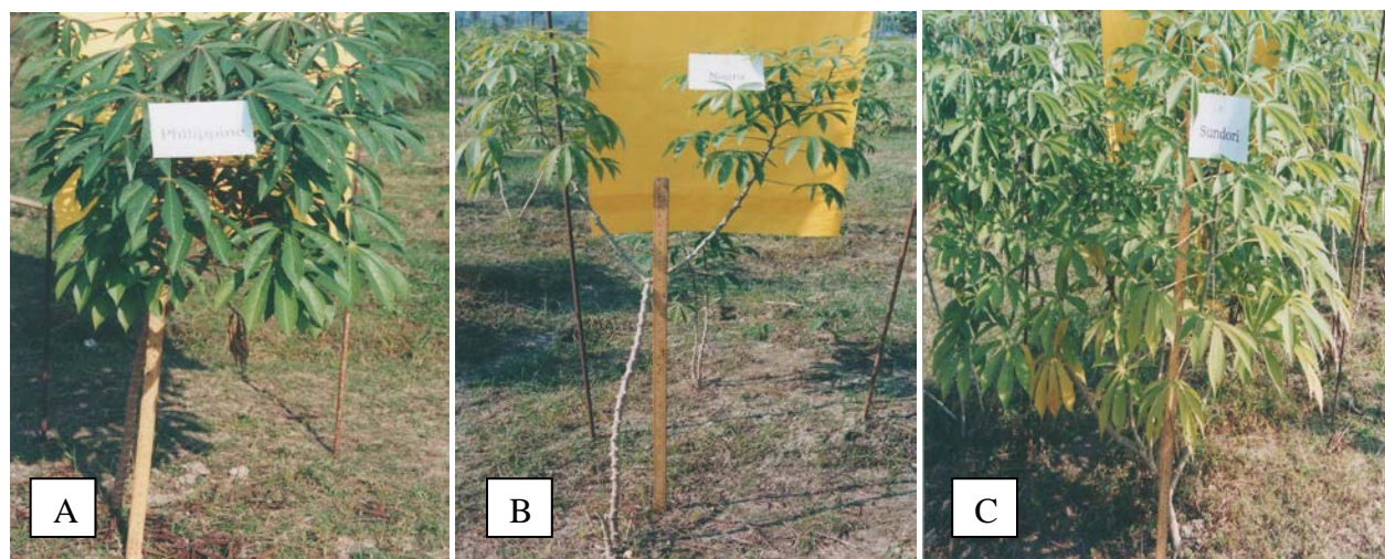
Plate 1. Canopy structure and branching habit in three Cassava Morphotypes (A: Philippine, B: Nagra, C: Sundori). Scale is 1m.